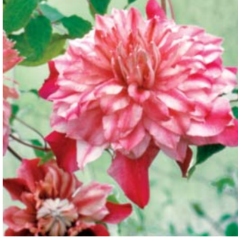
PATRICIA ANN FRETWELL™ Clematis (1 Tray)