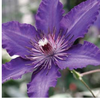
Niobe Clematis (1 Tray)