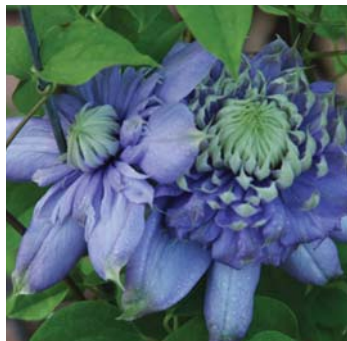
VANSO BLUE LIGHT® Clematis (1 Tray)